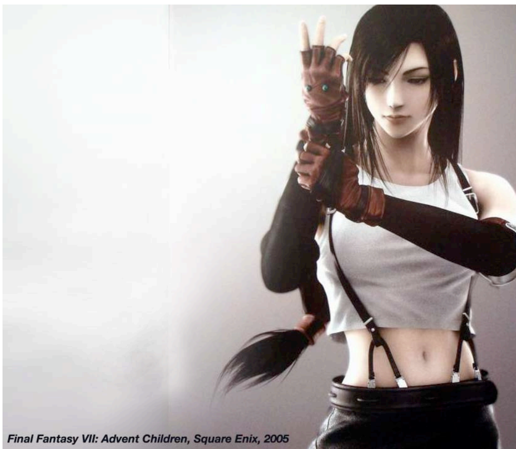
Final Fantasy VII: Advent Children, Square Enix, 2005

FRAMING THE PROJECT: This project locates itself at the intersection of a number of pressing issues for contemporary society, and simultaneously in an interdisciplinary and multi-medial space between several academic fields of inquiry. In its most general form, the central thread of the interlinked sub-projects is concerned with the matrix of relationships between evolving conceptions of politics, literacy and technology (particularly digital technology). In each case, first and foremost, the concern is with the way in which these shifting categories interact with, challenge, and actually constitute the 'humanity' of individuals in contemporary society and the way in which they interact politically