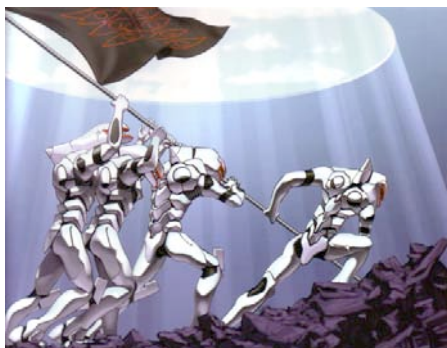
Neon Genesis Evangelion, Anno Hideaki (Gainax, 1995)